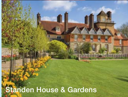
Standen House & Gardens