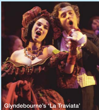
Glyndebourne's 'La Traviata'