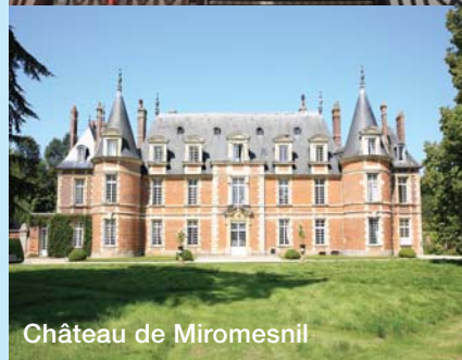
Château de Miromesnil